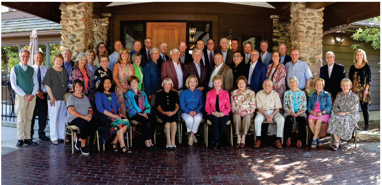
Members of The Foundation board of past and present gathered together on June 12.